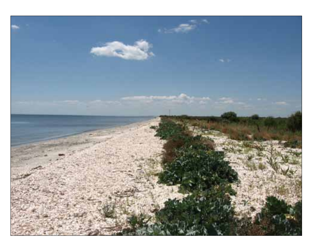
The pristine coastal zone of the Danube Delta bordered by beaches with a rich variety of natural resources, lakes such as Lake Razelm and Golovita and with a few coastal settlements such as Sulina and Sf Gheorghe. (photo: C. Coman)

(source: Romanian ICZM Strategy - Outline, 2005)