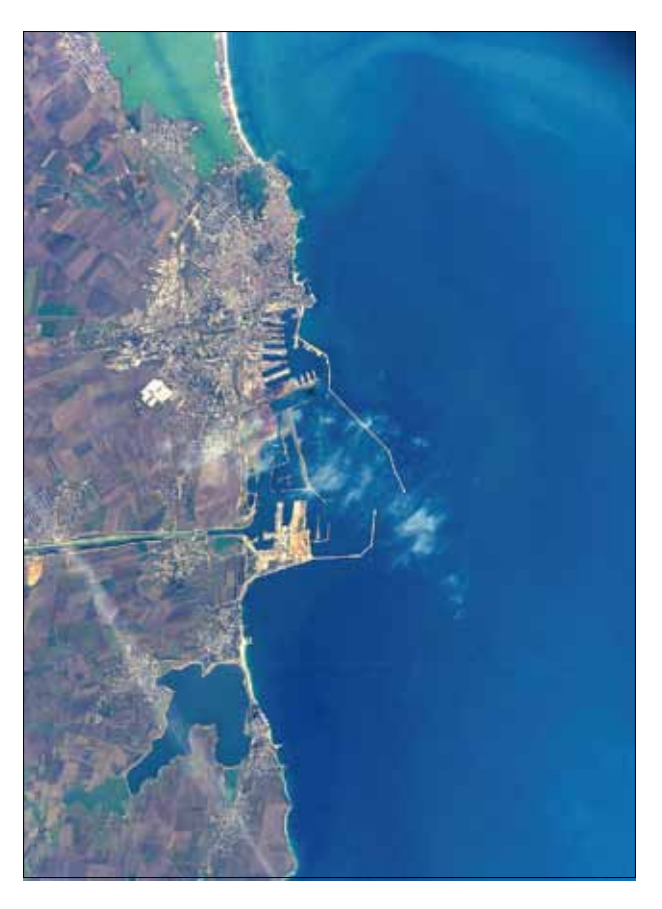
Constanta, the largest port at the Black Sea, surrounded by intensively used coastal plain. Constanta county: the harbour, city, Danube-Black Sea canal, agriculture grounds, coastal lakes and beaches.