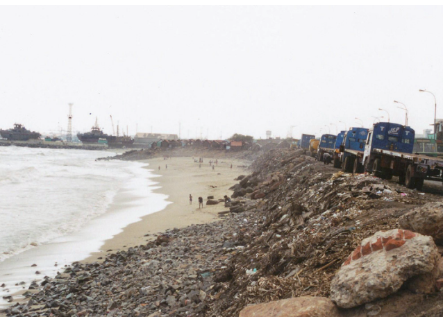
Severe coastal erosion affecting the coastal road, north of Chennai, Tamil Nadu, India.