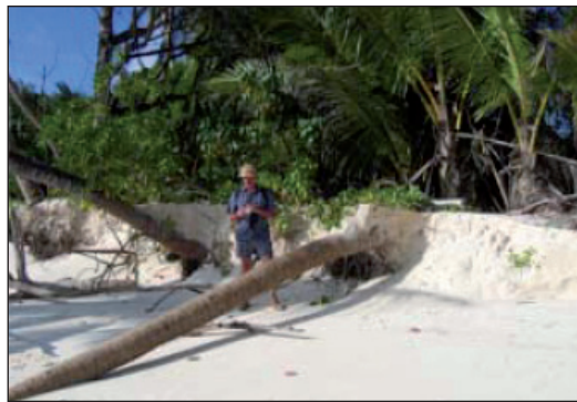
Upto 1.5 m 'cliff' erosion of back beaches at Anse Kerlan, north east Praslin Island, Seychelles, demolished turtle nests and palm trees - six weeks after the Tsunami struck the coast.