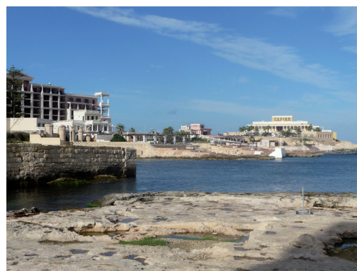
Malta coastal view with tourist accommodations under construction.