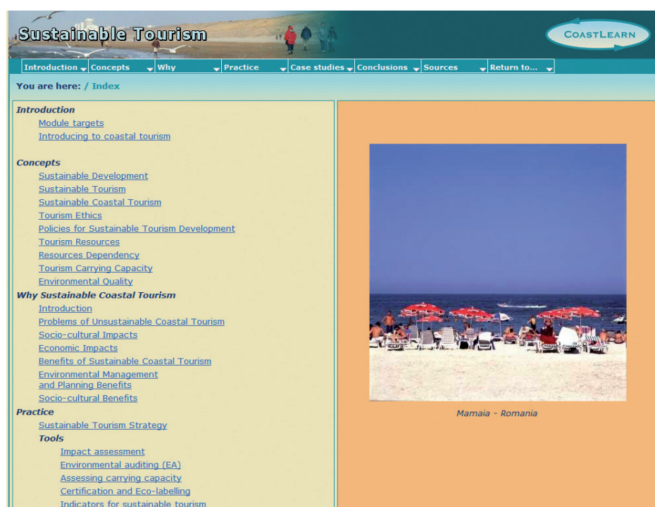
Figure 1: Screenshot CoastLearn Sustainable Tourism Module, www.coastlearn.org

CoastLearn partners have also jointly produced a Simulation game – CoMPAS Coastal Management Practices to Achieve Sustainability . The game is freely downloadable